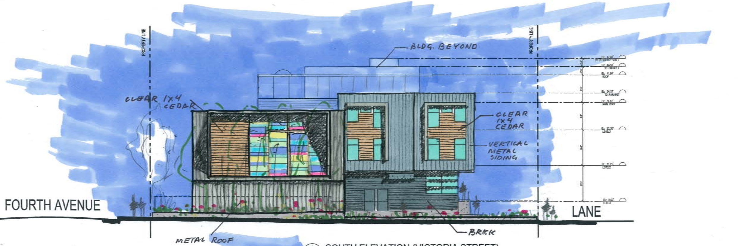
1 SOUTH ELEVATION (VICTORIA STREET) A4.1 SCALE 1/8"=1'-0"