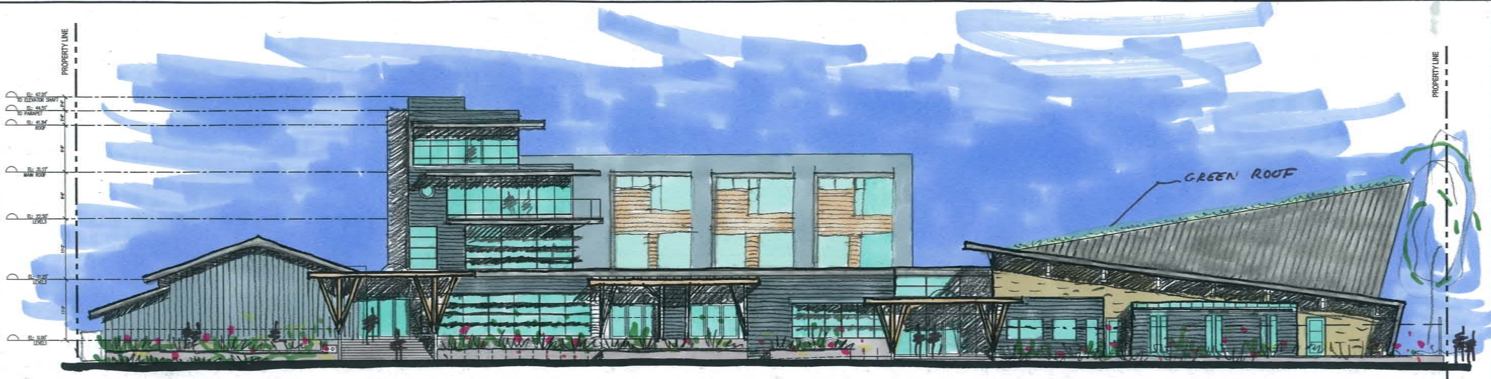
1 WEST ELEVATION (FOURTH AVENUE) A4.0 SCALE 1/8"=1'-0"