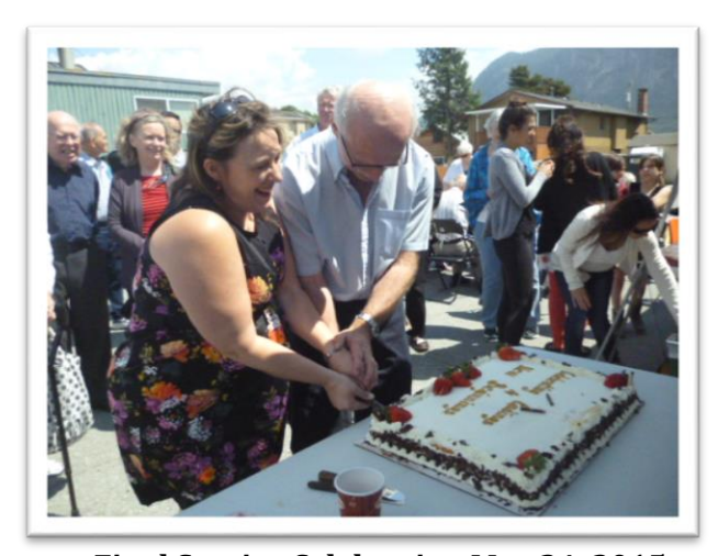
Final Service Celebration May 24, 2015